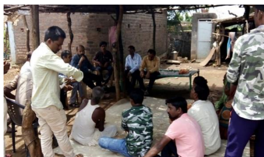
Fig: Marking Nut Value Addition & Processing facility at VDVk- Malegaon, Washim District, Maharashtra