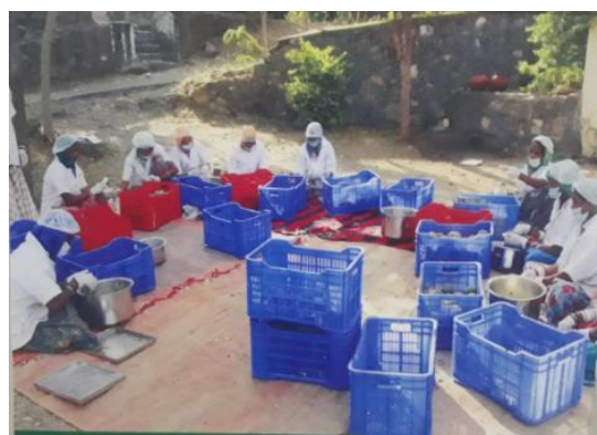
Fig: Custard Apple pulp extraction unit, VDVK Gogrud, Udaipur, Rajasthan