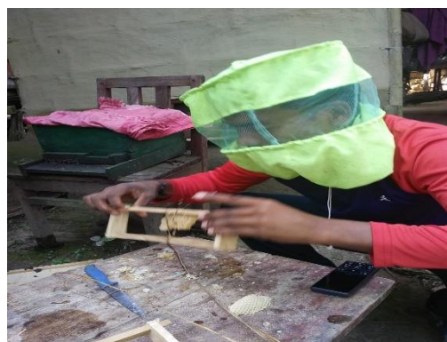
Fig: Honey Value Addition & Processing Facility at VDVk Dhanubanga, Rangjuli, Goalpara, Assam