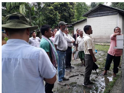
Fig: Honey Value Addition & Processing at VDVK Barbari, Baksa District, Assam