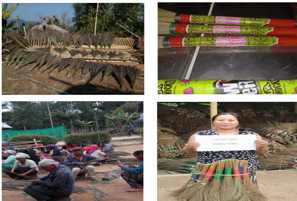
Fig: Broom Processing & Production Facilities at Tobu Tehsil, Mon District, Nagaland

TRIFED has sanctioned 20 VDVKs in the State of Nagaland on 2 Sep 2019 for setting up of processing, value addition, packaging & marketing units for Hill Grass, Basil Leaves , and other forest produce collected by tribal gatherers. The VDVK units have commenced value addition work in Hill Grass for making Hill Brooms in the districts of Tuensang, Longleng, Mon & Kiphire. This value addition work carried out by the VDVK led to the price realization of around 3 times over the raw MFP value.