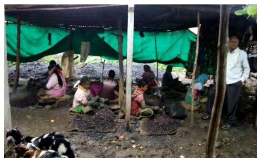
Fig: Marking Nut Value Addition & Processing facility at VDVk- Malegaon, Washim District, Maharashtra