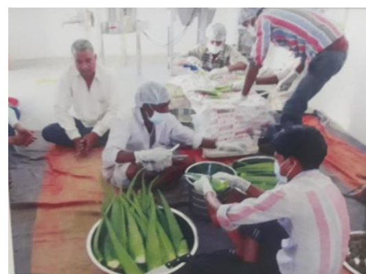
Fig: Aloe vera processing unit, VDVK Gogrud, Udaipur, Rajasthan