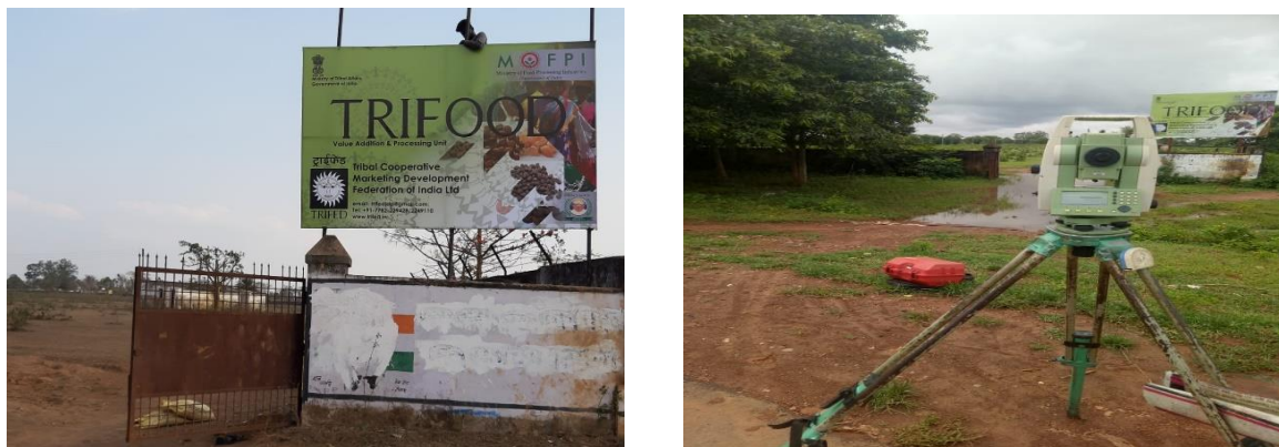
Fig: TRIFOOD Project Site Location at Semra Village, Jagdalpur, Chhattisgarh

TRIFED has appointed a Project Management Consultancy (PMC) for assisting in the implementation of the two TRIFOOD projects at Jagdalpur, Chhattisgarh & Raigad, Maharashtra. The field survey work at the project location has been initiated and topographical survey work has been completed. The projects are launch-ready at the convenience of the Hon'ble Prime Minister, Hon'ble Union Minister for Tribal Affairs.