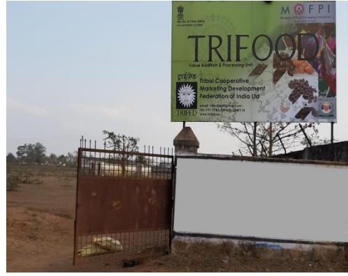
Fig: Soil testing under progress for TRIFOOD project at Jagdalpur, Chhattisgarh