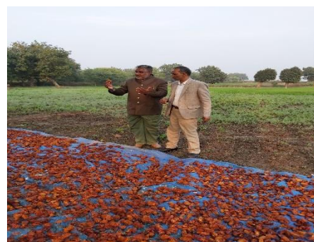
Value addition operations by VDVK members for value addition and drying of Bel Gudha, VDVK Madawara, Lalitpur, Uttar Pradesh