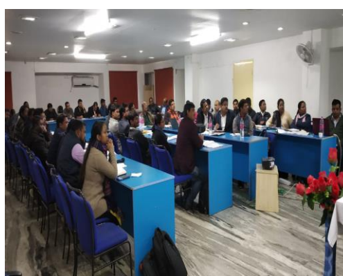
Fig: State Workshop with District Programme Managers at Ranchi, Jharkhand