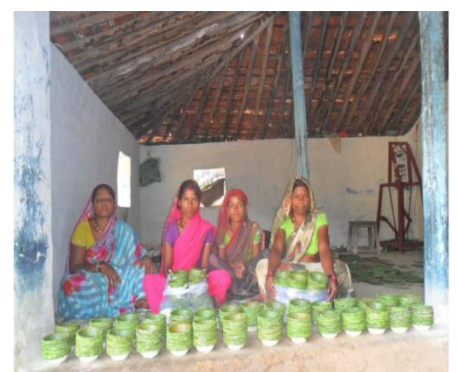
Value addition operations by VDVK members for value addition drying & Dona Pattal, VDVK Junnardeo, Chhindwara, Madhya Pradesh