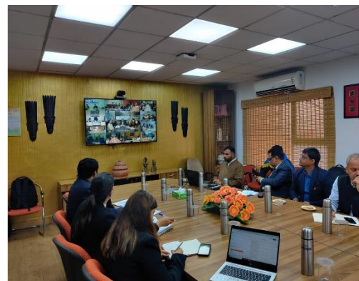
Fig: VC Meeting with State Nodal Department & Implementing Agencies for Van Dhan