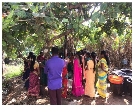
Advocacy and trainings provided to VDVK members for sustainable harvesting of Honey, value addition on Honey and packaging being initiated by the VDVK members on 05.02.2020