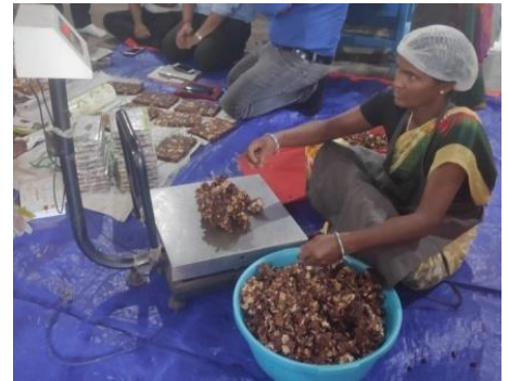
VDVK Pucca Premises, District level trainings to VDVK members for value addition operations for Tamarind at Daru Village VDVK, Hazaribagh District, Jharkhand