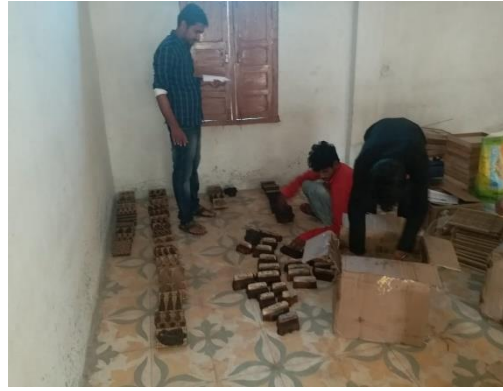
Fig: Training of VDKV members in Bag Printing Sarees, Barwani Madhya Pradesh