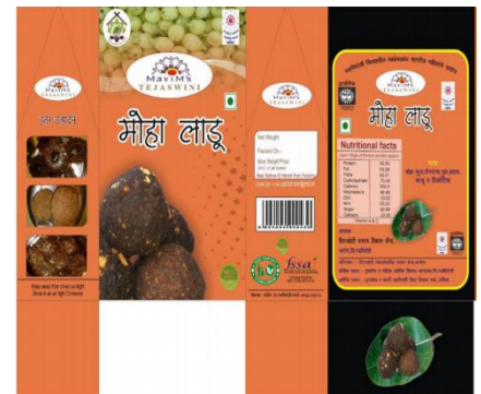
VDVK Pucca Premises, trainings to VDVK members for value addition operations for Mahua Ladoo at Deepjyoti VDVK, Dhanora, Gadchiroli District, Maharashtra