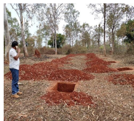
Value addition operations by VDVK members for value addition drying of Baheda, and plot preparation for construction of VDVK Storage, Gotiya VDVKs, Jagdalpur, Chhattisgarh