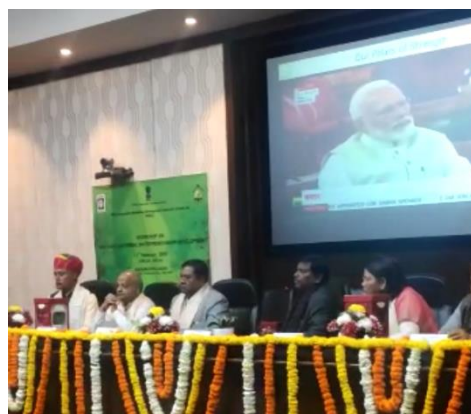
Fig: Van Dhan Workshop with Tribal Members of Parliament (MPs), New Delhi